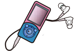
Mobile music players