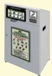
collection boxes appearance